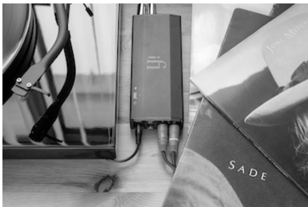
The iPhono3 Black Label's compact chassis packs in a host of top-quality circuitry to deliver spellbinding sound

The TubeState engine delivers a sound of exceptional poise – crystalline clarity without a hint of edginess; free-breathing dynamics; engaging pace and timing; and a soundstage brimming with texture and fine detail. From the moment the needle hits the record, everything sounds crisp and clear, yet no single element within the musical whole is over-emphasised – you hear the music, cohesive and in its entirety, as it was intended to be heard.