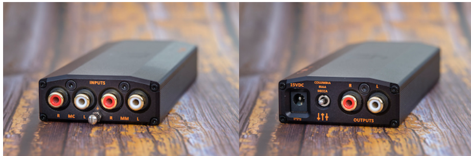
Cable connections are at opposite ends of the slim line chassis – MM/MC inputs at one end, power in and audio out at the other.