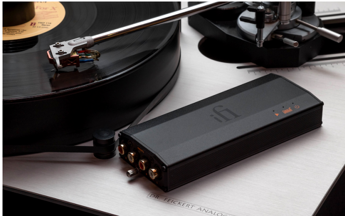
Above: iFi iPhono3 Black Label