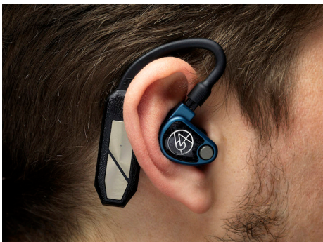
Left The GO pod's pliable ear loop hooks behind the listener's ear

The GO pod is distinctly different. Each of these critical stages is designed separately and optimised individually to ensure excellent sound quality – like an audio system made from individual hi-fi components. In addition, much like top-level hi-fi speakers, high-quality corded IEMs are engineered for sonic excellence, combining multiple high-tech drive units to transmit sound directly into your ear canal. Connect a pair of these IEMs to the GO pod and it's no wonder that the resulting sound is so much better than regular true wireless earbuds, given the level of audio engineering involved.