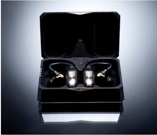
Left The GO pod's charging case protects a pair of pods with or without connected IEMs and provides multiple recharges for up to 35 hours of playing time

The GO pod comes with a smartly designed charging case, with softly lined internal compartments and sufficient room to accommodate connected IEMs as well as the pods themselves. A 1500mAh rechargeable battery is built into the charging case; a pair of GO pods will play for up to seven hours on a single charge, while the case provides multiple recharges to enable up to 35 hours of playing time. The case supports both Qi wireless charging and USB-C fast charging.