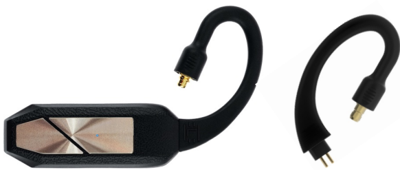
Left The GO pod's ear loop can be detached and swapped for another with a different IEM connector

Those familiar with iFi audio devices will know that the company uses discrete, high-grade components in its circuit designs, and the same is true of the GO pod. Devices such as TDK COG multilayer ceramic capacitors and inductors from Taiyo Yuden and Murata deliver qualities such as low ESR (Equivalent Series Resistance) and high linearity, paying great dividends in terms of sound quality.