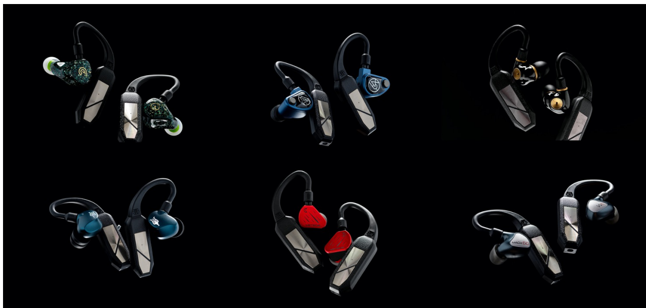
Top row from left GO pod + Craft Ears Aurum; GO pod + 64 Audio U4s; GO pod + Meze Audio Advar

As a standalone product, the GO pod will have an RRP of £399. Each pair will come with two ear loops catering for MMCX and 2pin IEM connections; additional ear loops for Pentaconn, T2 and A2DC connections will be available at £29 each.