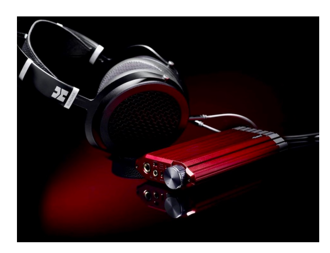
Left Despite its compact size, the iDSD Diablo 2 is a versatile powerhouse that can drive the toughest headphone loads