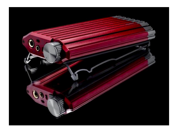
Left Like a sprinter about to explode from the blocks, the iDSD Diablo 2 raised on its desk stand is a vision of compact power and poise

The amp stage supplies three gain settings to suit the drive requirements of the connected headphones or IEMs. The default mode is Normal (0dB); from there you can step up to Turbo (+8dB) or Nitro (+16dB). There is also an IEMatch attenuation mode – this is particularly useful with super-sensitive IEMs, removing potential background noise and increasing the usable volume range. Volume is controlled by a high-quality analogue potentiometer, which delivers superior sonic transparency compared to chip-based volume controls and can be locked in place to avoid accidental adjustment.