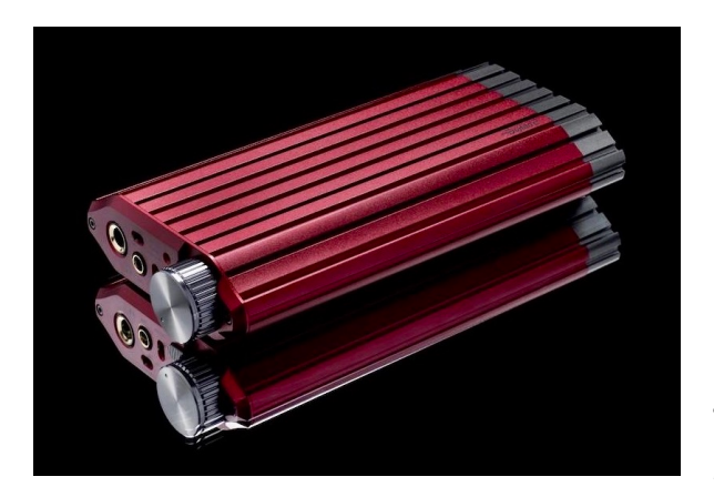
Left The iDSD Diablo 2's grooved aluminium enclosure delivers distinctive form and practical function

The 22 grooves are not just for show; they aid thermal dissipation and double as fixing rails for the devilish 'wings' supplied with the iDSD Diablo 2. These detachable appendages act as a desk stand and can be positioned in different ways, allowing the Diablo 2 to be placed horizontally or vertically as its owner prefers. Versatile, desirable and fiendishly clever, the Diablo 2 makes a striking statement even before you switch it on.