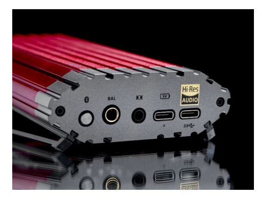
Left The iDSD Diablo 2's crimson aluminium enclosure sports a grey polymer end piece to aid Bluetooth signal reception

As well as being the first portable DAC to support aptX Lossless, the iDSD Diablo 2 is the first to include Bluetooth version 5.4 – the newest Bluetooth standard, announced earlier this year. This ensures the greatest wireless range and stability, highest speed and lowest latency between the source device and the DAC. The Diablo 2 stores up to eight paired Bluetooth source devices in its memory, making it easy to switch between them.